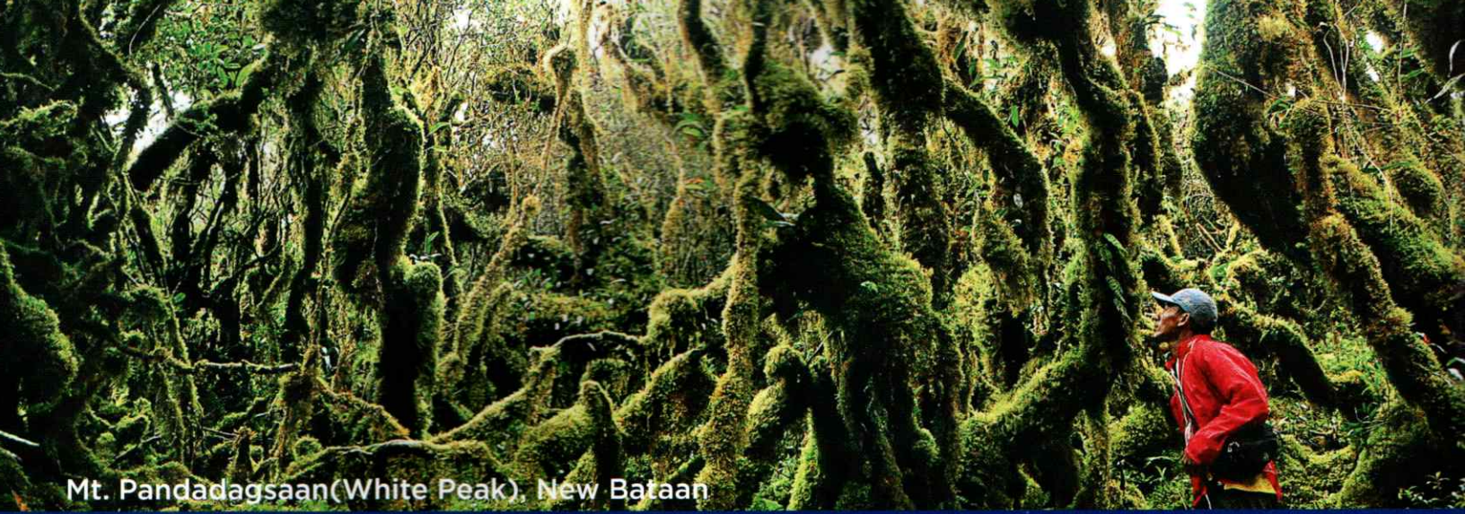
Mt. Pandadagsaan(White Peak), New Bataan